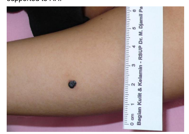
Figure 1. Black pimple on the right lower arm

A 19-year-old woman came to Dermato-Venereology out-patient Department of Dr. M. Djamil Hospital on December 28th 2011 with chief complaint there was a black pimple on the right lower arm since one month ago. Initially, about 2 years ago, there was a tiny reddish pimple arised on her right lower arm. The size of the pimple only as pinhead size. The pimple was painless, sometimes itchy, not easy to bleed although she scratched it, and not become large since appeared. In last two months, she often touched the pimple and scratched it because itchy. Since one month ago, she felt the pimple become larger and easily bleed after she scratched it and the color turned into black. On physical examination we found a solitare black papule, with 0,3x0,4 mm in diameter, round shape, fine scales, the regular border with irreguler surface. Then, we diagnosed this patient with pigmented naevus at the beginning with differential diagnosis pigmented basal cell carcinoma (T<sub>1</sub> N<sub>0</sub> M<sub>0</sub>) and pyogenic granuloma. To exclude those differential diagnosis, we did histopathology examination by skin biopsy and the result showed mild acanthosis dan hyperkeratosis on epidermis and superficial dermis containing thicked-walled and very dilated thin-walled vessels that full-filled with erythrocytes and are lined by an endothelial layer. There are also seen bleeding area and mild lymphocytes perivasculer. This features supported to AH.