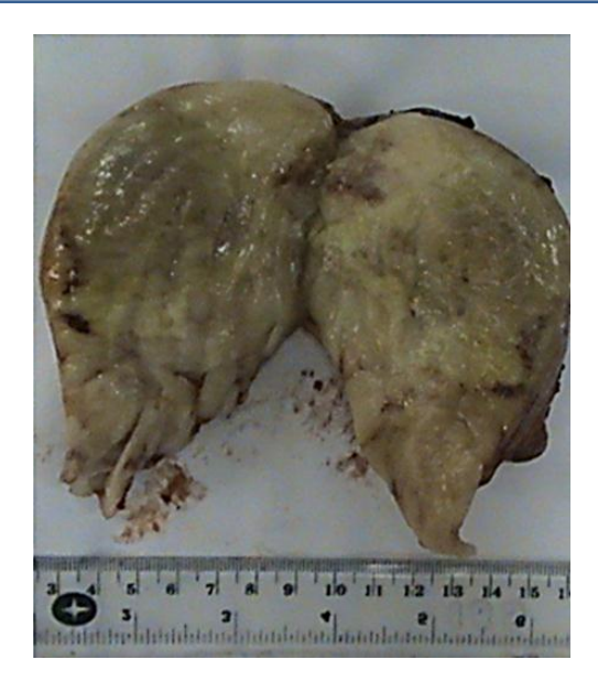
Figure 3. Surgical specimen, the mass was 9 x 8 x 5 cm in size, solid, multi lobes, cut surface showed white and homogenous.

Diagnosis after surgery was post medial parotidectomy on indication right parotid pleomorphic adenoma involving PPS. Evaluation after surgery, there were no active bleeding, no facial nerve paresis. On laboratory examination was found haemoglobin 12,3 gr/dl. The patient was given therapy ceftriaxone 2 x 1 gr IV, tramadol 50 mg drip in 500 ml Ringer Lactat. Suggested soft meal diet.