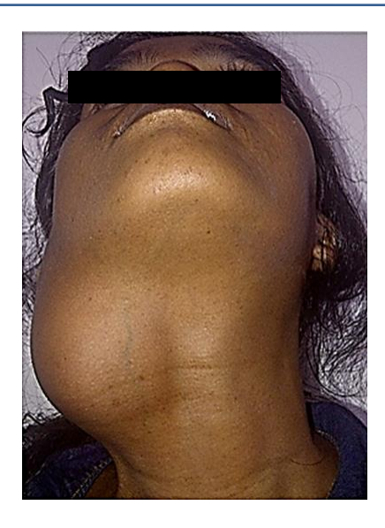
Figure 1. On physical examination of right parotid to neck region was found mass with 11 x 10 x 6 cm in size.

Working diagnosis was suspicious benign right parotid gland tumor with IX,X,XII nerves paresis. Differential diagnosis were benign thyroid tumor, peripher neurogenic tumor, and paraganglioma carotid body. Planned to perform Fine Needle Aspiration Biopsy (FNAB), Computed Tomography (CT scan) of neck region, thyroid function laboratory examination (T3, T4, TSH), thorax x-ray and angiography.