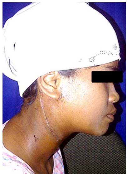
Figure 4. On day seven after surgery.

Two weeks after surgery, there was no complaint. On physical examination there was no swelling at the neck, no sweating while chewing. On telelaryngoscopy examination was found larynx pushing to medial minimal